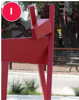
I Red Pony Russ Connell Dallas, Texas Steel, 2014 Hwy 46 at Esser 369 S. Esser Road