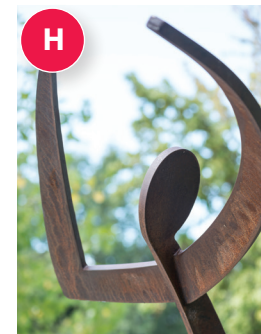
H Dancer 2015 Jerry Daniel Sanger, TX Welded steel, 2015 River Road Park 415 River Road