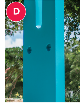
D Bunny Jeffie Brewer Nacogdoches, TX Steel, 2015 Cibolo Trailhead near Ye Kendall Inn 128 W. Blanco Road