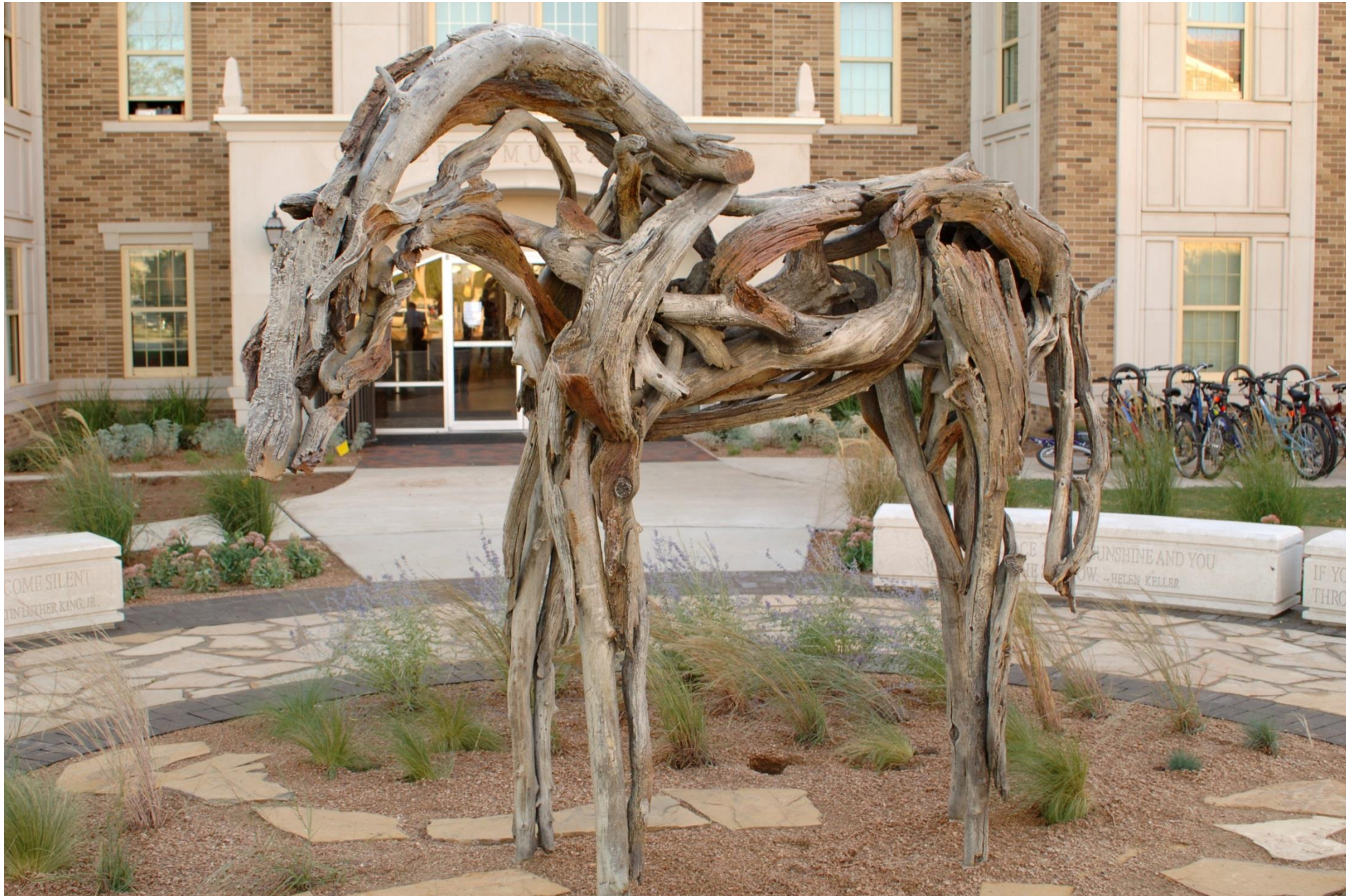
“Wind River” by Deborah Butterfield, located southeast of the courtyard in front of Murray Hall