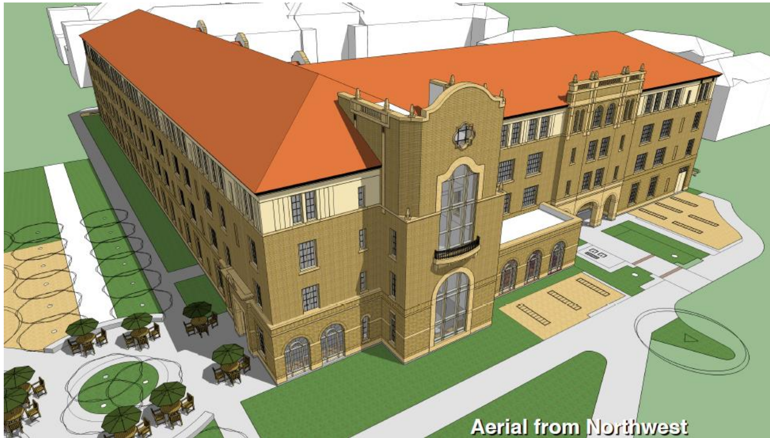
Aerial from Northwest