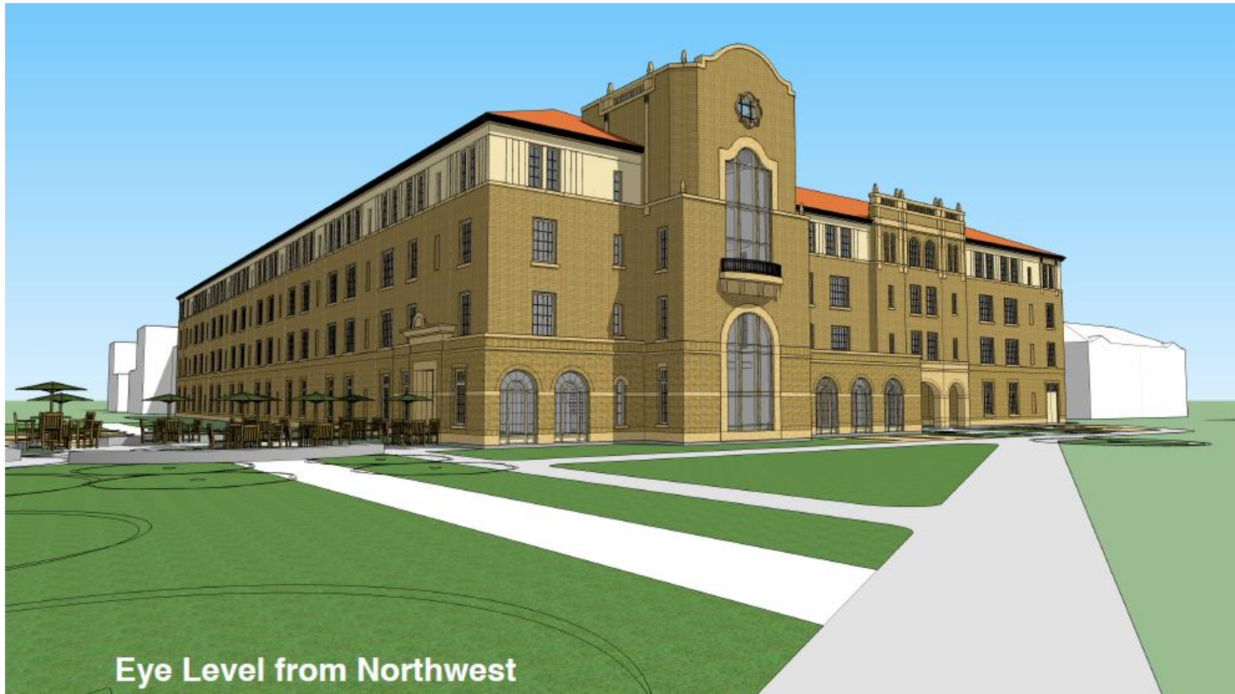
Eye Level from Northwest