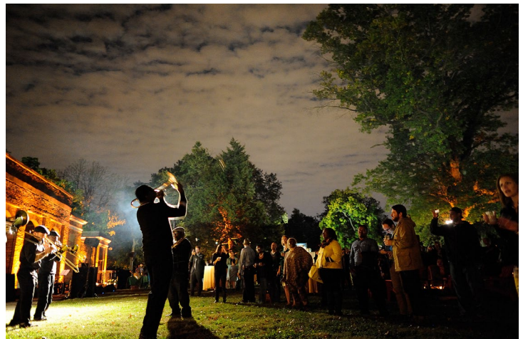
GLOW in the Park , 2014