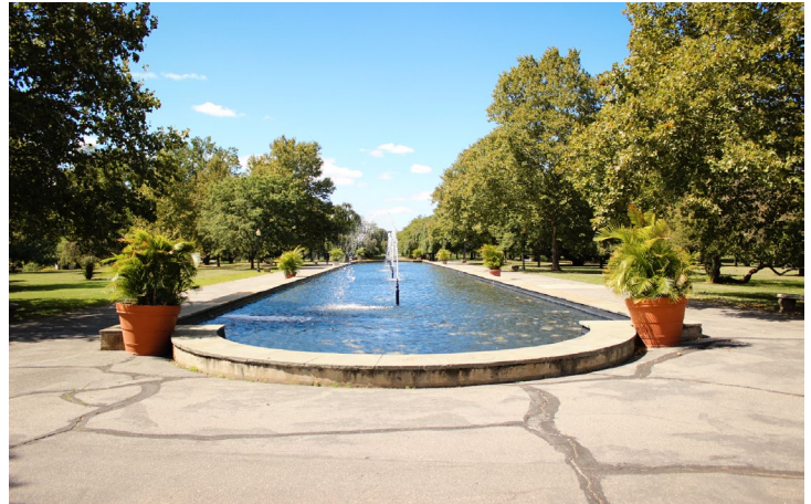
Horticulture Center Reflecting Pool