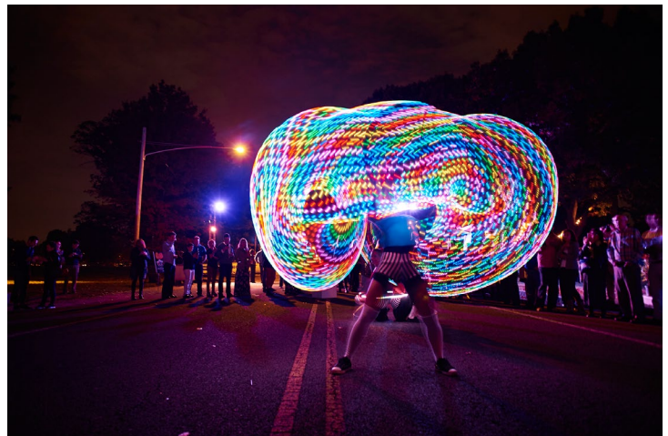
GLOW in the Park , 2015