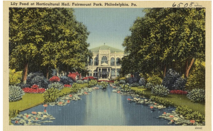
Illustration of Horticultural Hall, built for the 1876 Centennial Exposition and demolished in 1954.

The Reflecting Pool is nearly 300' in length, with a width of approximately 35' and a depth of approximately 1'-2'. It is located between the Horticulture Center and the Centennial Arboretum, directly adjacent to Alexander Stirling Calder's Sundial sculpture.