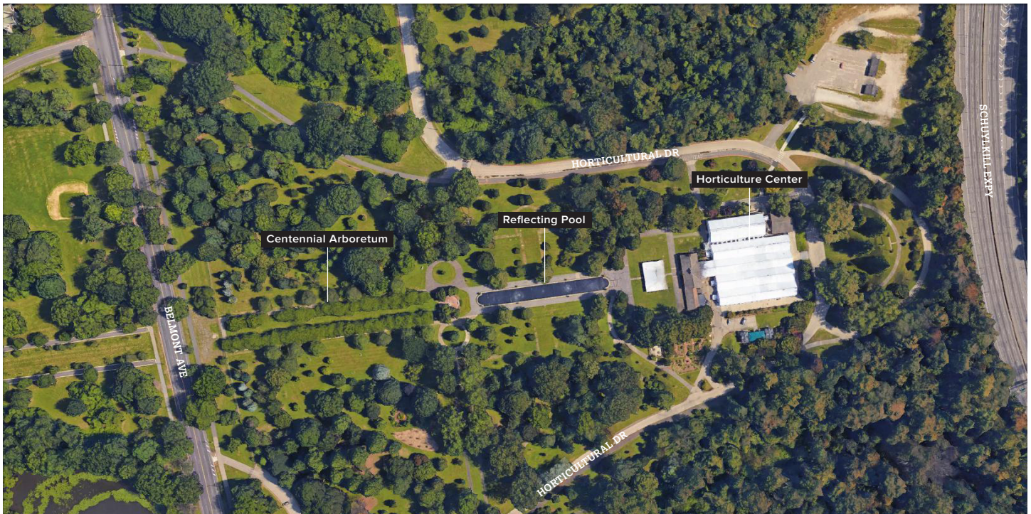
Aerial view of the Horticulture Center, Reflecting Pool, and Centennial Arboretum