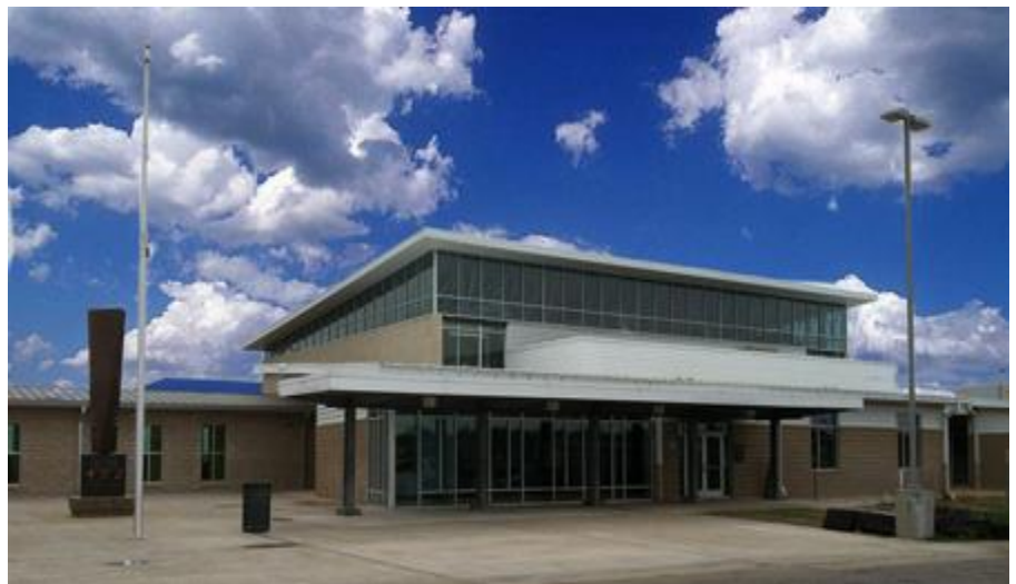
Turner Roberts Recreation Center

Located Northeast of downtown Austin, the 93-acre Colony Park District Park is bordered by Loyola Lane to the south, Decker Lane to the East and Johnny Morris Road to the West. The park is adjacent to Overton Elementary School and the Turner-Roberts Recreation Center which are sited on 50 acres of land owned by the City and leased to AISD. The recreation center is an 18,700 square foot building which makes use of environmentally-friendly building materials and is situated on the site for best use of North/South energy efficient heating and cooling savings. It offers recreational and leisure opportunities to