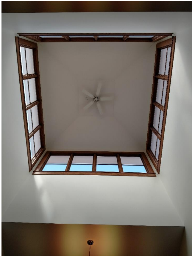
Looking upwards in the library's cupola, the fan in the above photograph will be removed before the artwork's installation.

to know. The library has provided summer art classes for eleven years with grants from the Indiana Arts Commission, administered by the Tippecanoe Arts Federation.