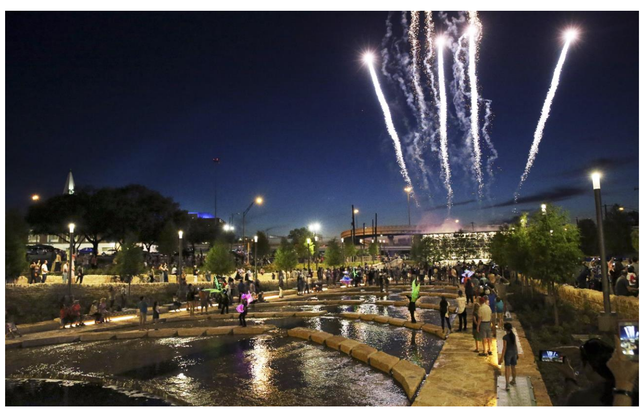
San Pedro Creek Culture Park Grand Opening (Phase 1.1), May 5, 2018 View of Plaza de Fundacion (artwork location not in view)