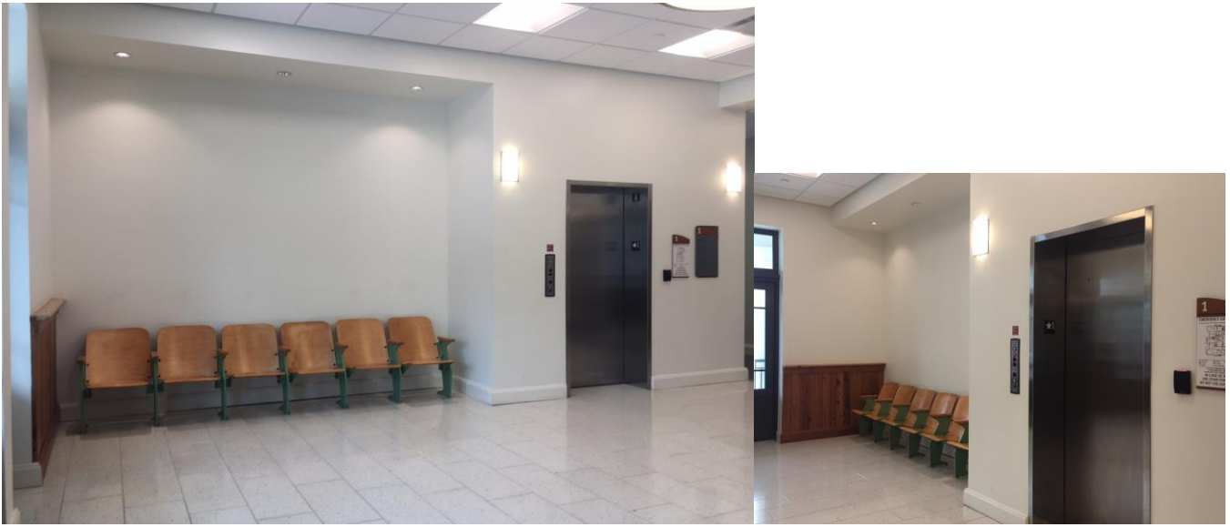
Figure 2 and 3 - # 4. Front Lobby – above chairs