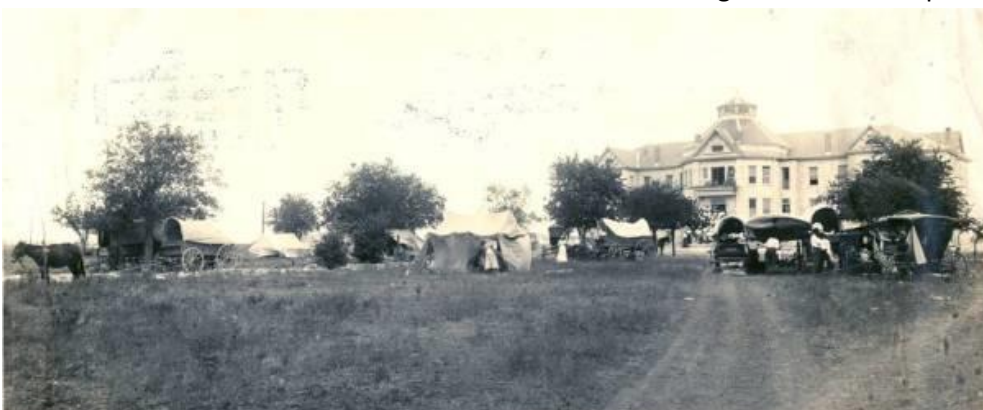
St. John's Orphan Home

In the early 1900's the site which is now Highland mall held the St. John's Orphan Home. It was an important School for African American children. During the summer, The 350-acre farm land and main building hosted an annual church encampment that included sermons, games, contests, parades, practical demonstrations and barbeque stands for tens of thousands of people. The home closed in the 1930's due to lack of funds and later burned to the ground under suspicious circumstances.