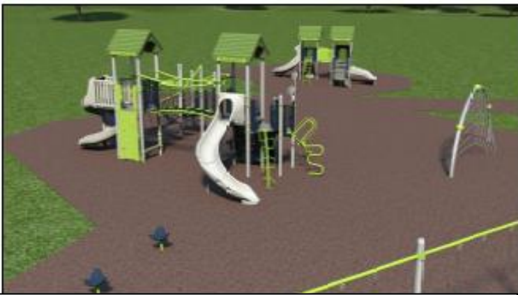
Possible Play Structures