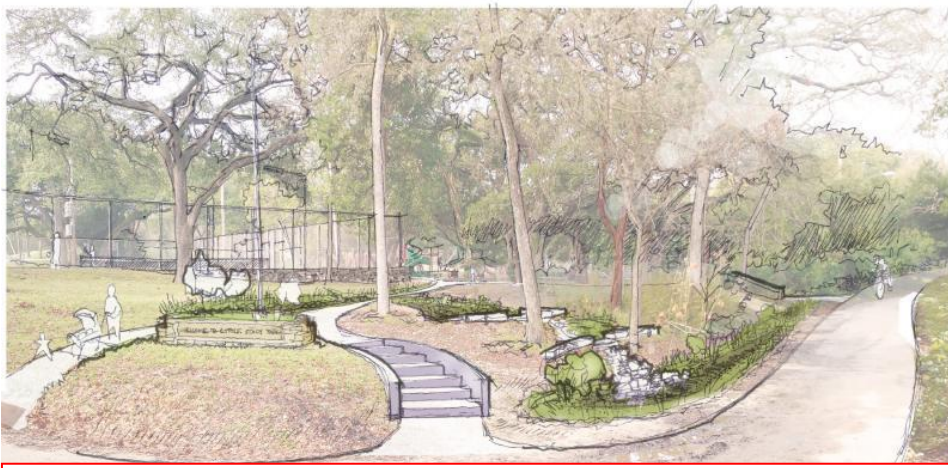
North East Entrance & Signage

Six areas are given priority in the park's design: Arrival and Identity, Shelter House and Lawn, Circulation and Cohesion, Basketball and Tennis, Green Infrastructure and Stormwater and Play.