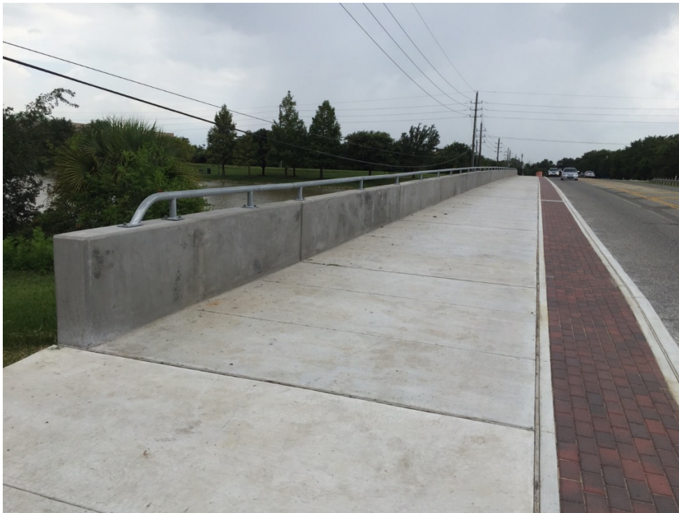
Caption: Current image of existing east side of Brooks Street Bridge. (prior to arm rail/lighting improvement).