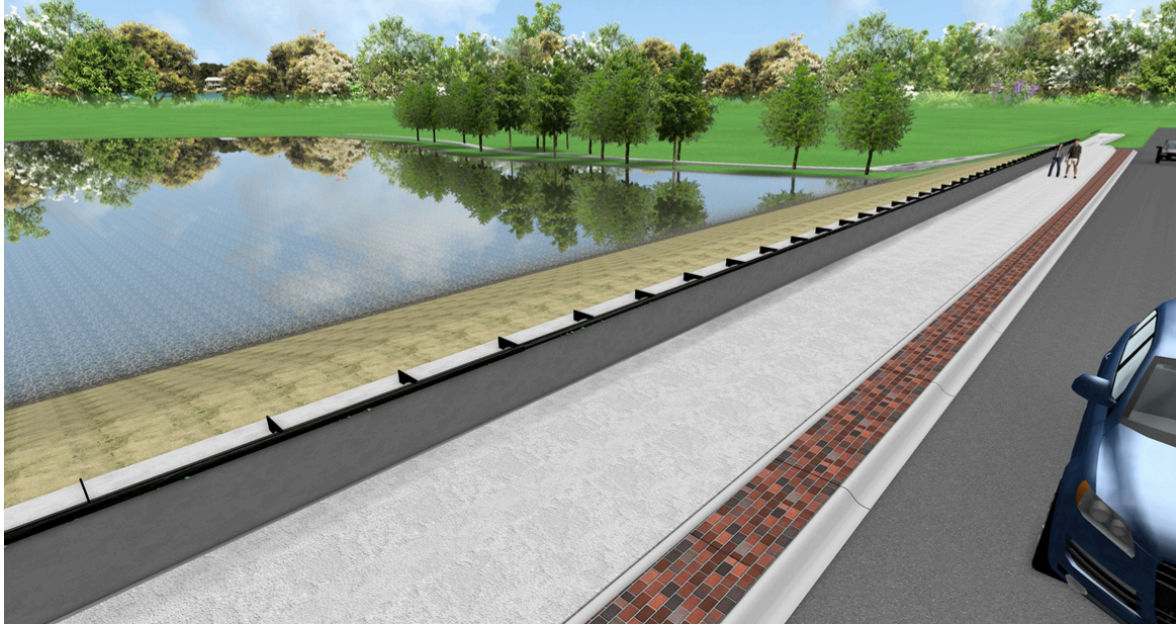
Caption: Image of improved lighting scene during the daytime on east side of Brooks Street Bridge.