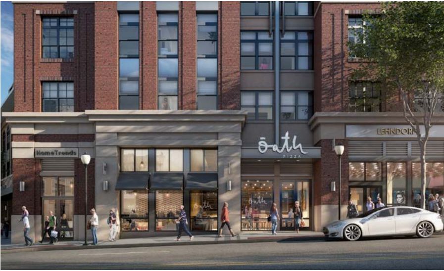
RESIDENTIAL & RETAIL DEVELOPMENT