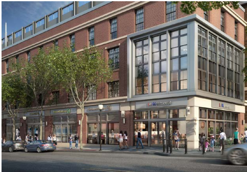
RESIDENTIAL & RETAIL DEVELOPMENT