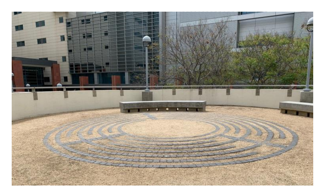
Fig. 2: Upper level courtyard artwork site. The current labyrinth shown will be removed.