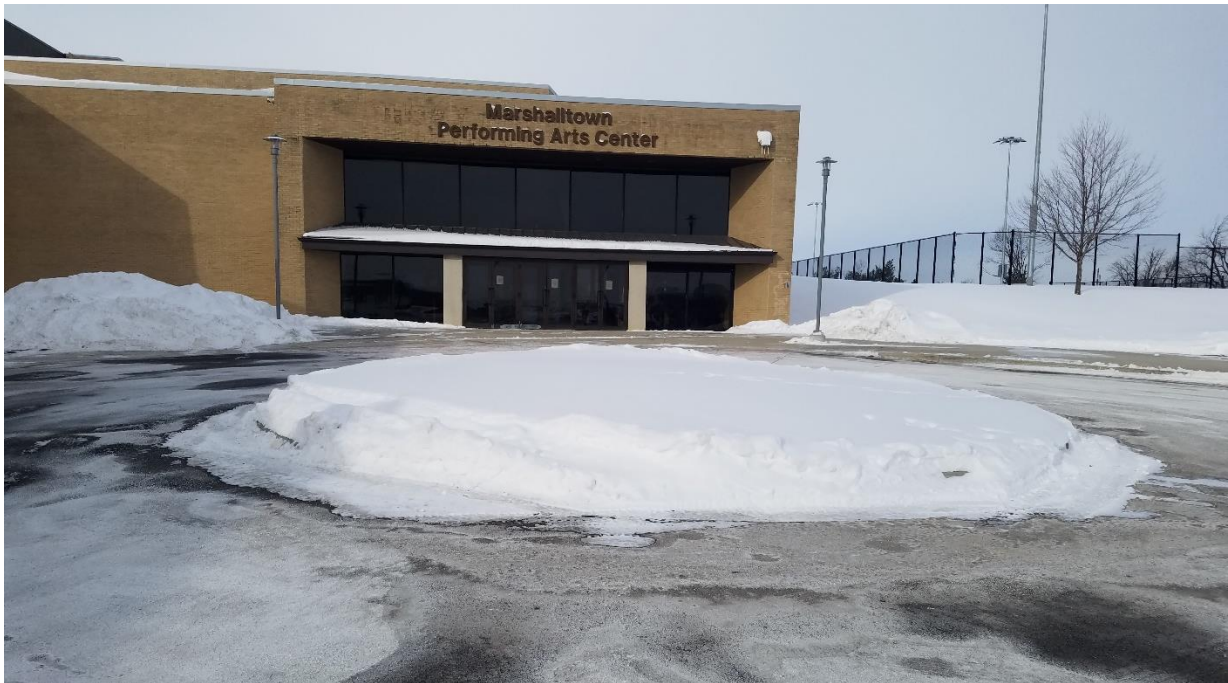
The circle round about is 30' in diameter (when not covered with snow)