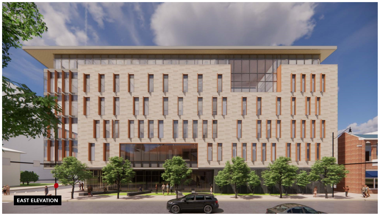
Illini Hall east elevation Fifth floor ommon area looking east across Wright St. and overlooking Altgeld Hall