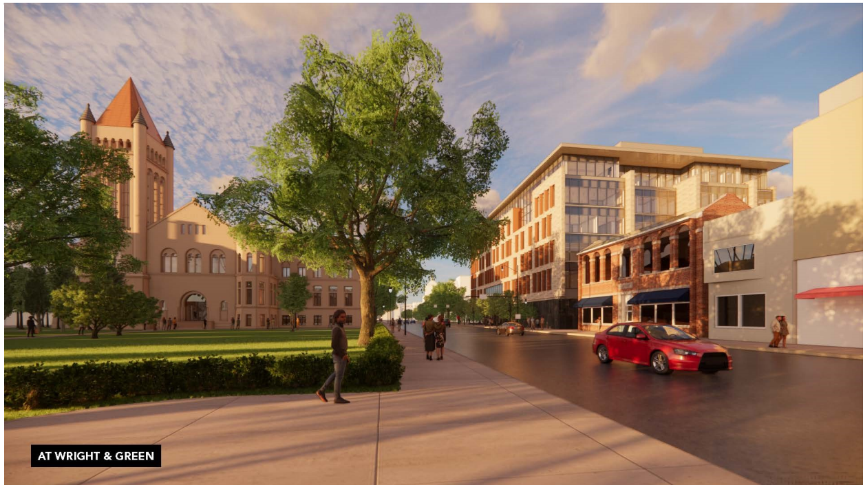
Illini Hall looking southwest from Wright and Green Sts. Illini Hall looking northwest from Wright and John Sts.