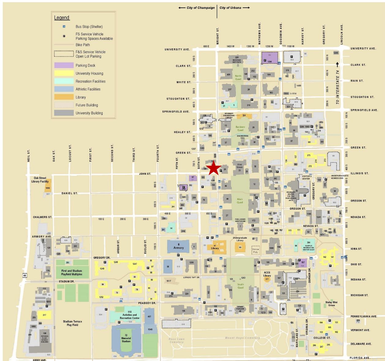
Campus map with project site.