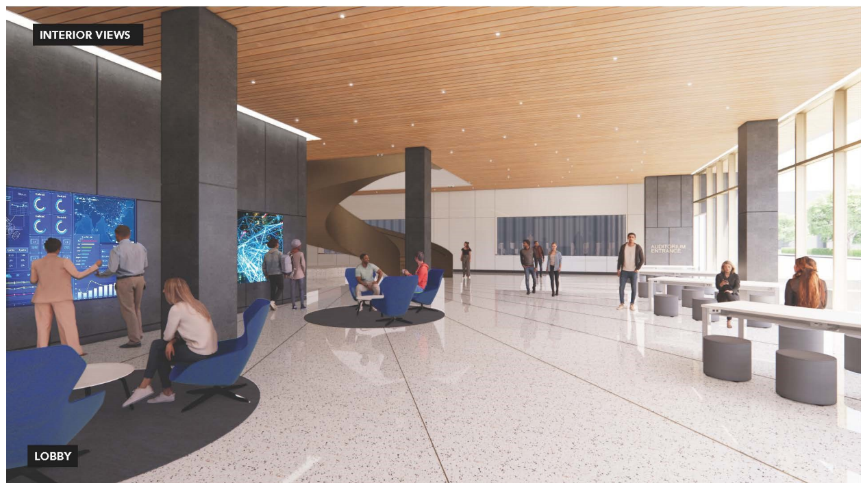
Lobby looking north Atrium at third floor