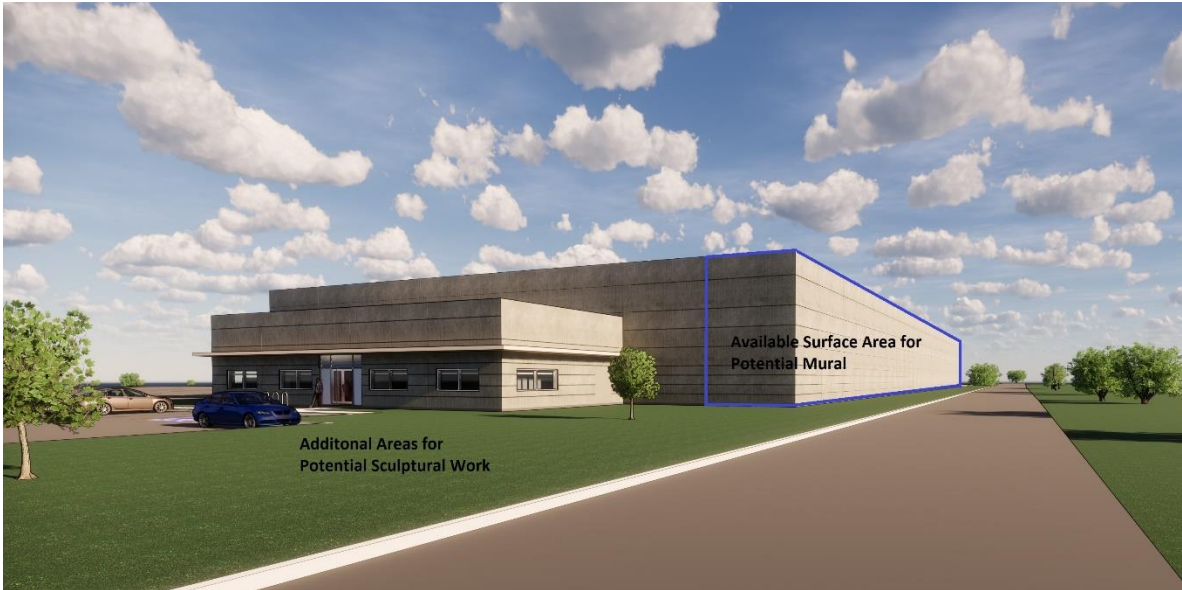
Possible artwork locations