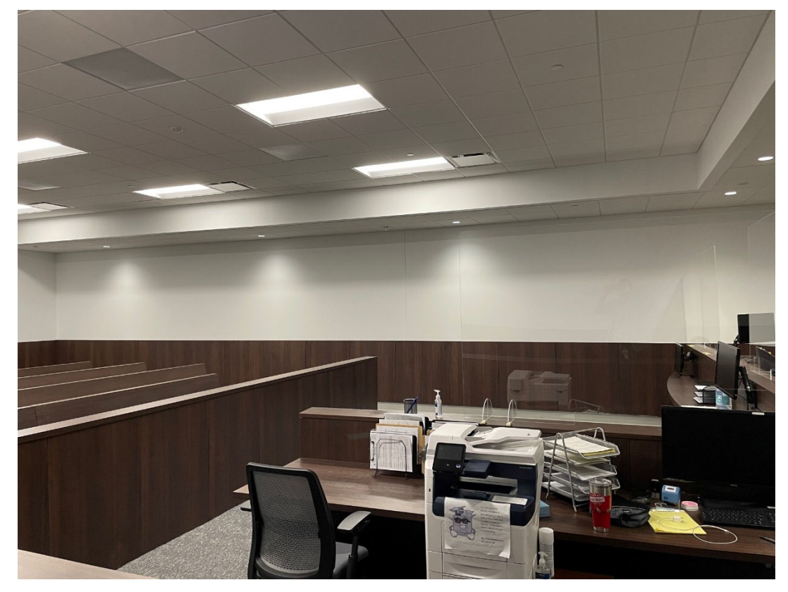
The City of Austin Municipal Courthouse Art Program Management: Request for Qualifications Vendor: poorgirlempire.com