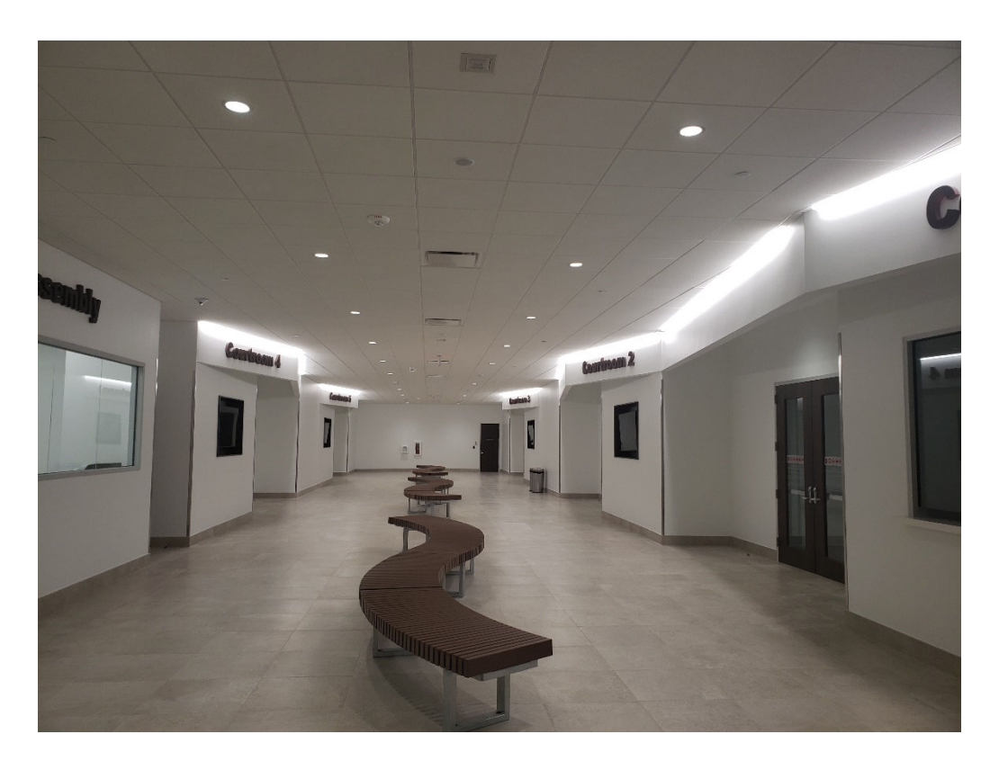
The City of Austin Municipal Courthouse Art Program Management: Request for Qualifications Vendor: poorgirlempire.com