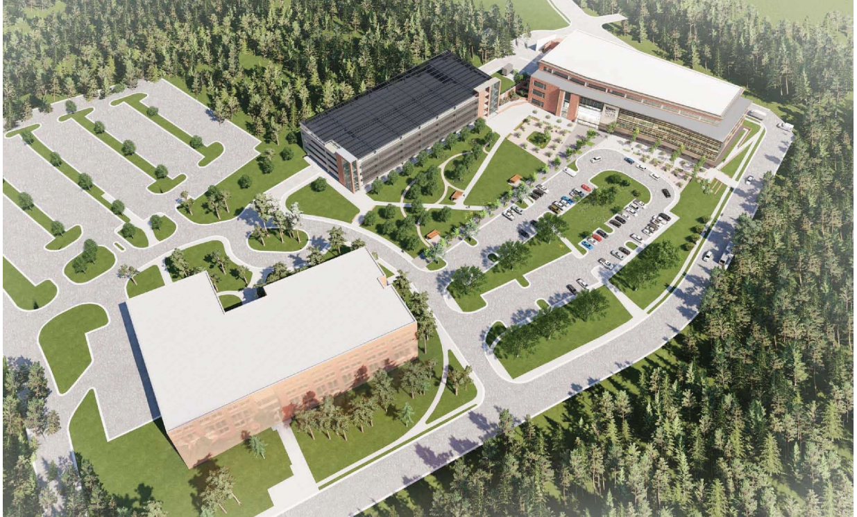
Concept Rendering Health & Human Services Campus

DEADLINE FOR SUBMISSIONS 2:00PM(EST), Wednesday, June 22nd, 2022