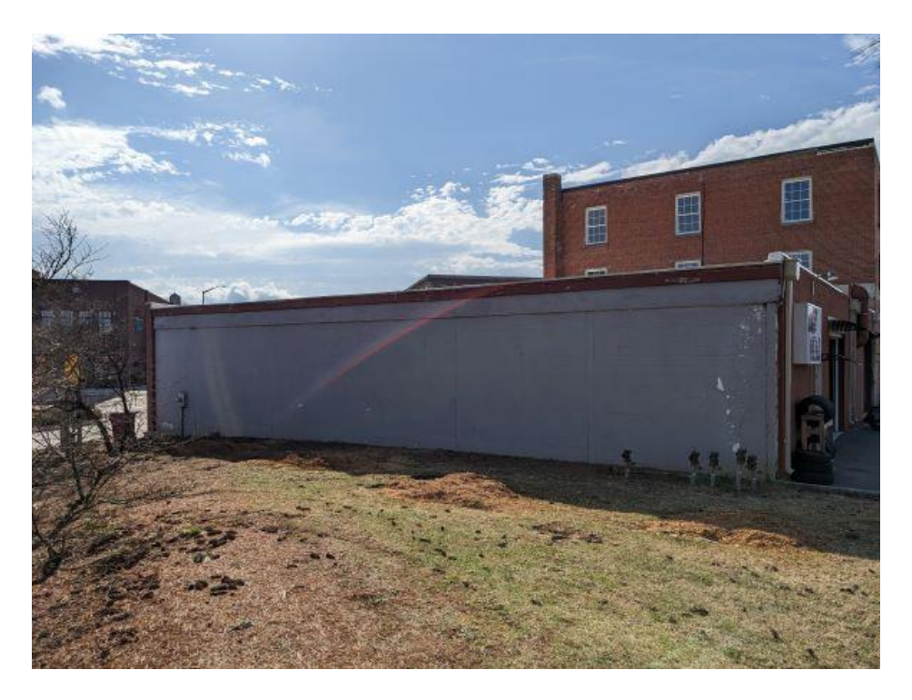
(Lower Wall Only)