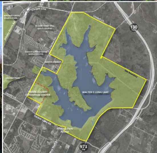
Walter E. Long Metro Park is regionally renowned for its beautiful lake with its surrounding natural resources, and also as an outstanding fishing location.