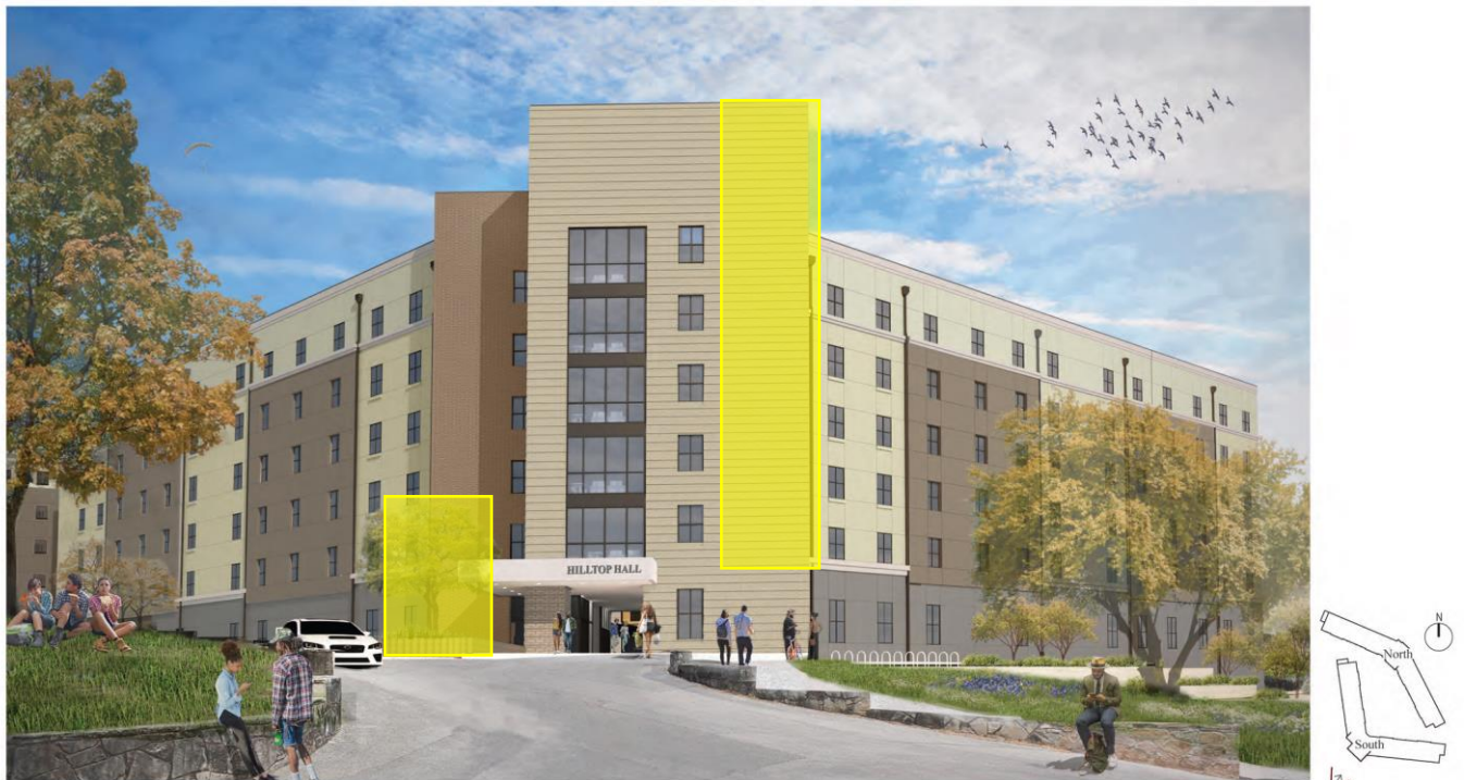
EXTERIOR RENDERING - MAIN ENTRY