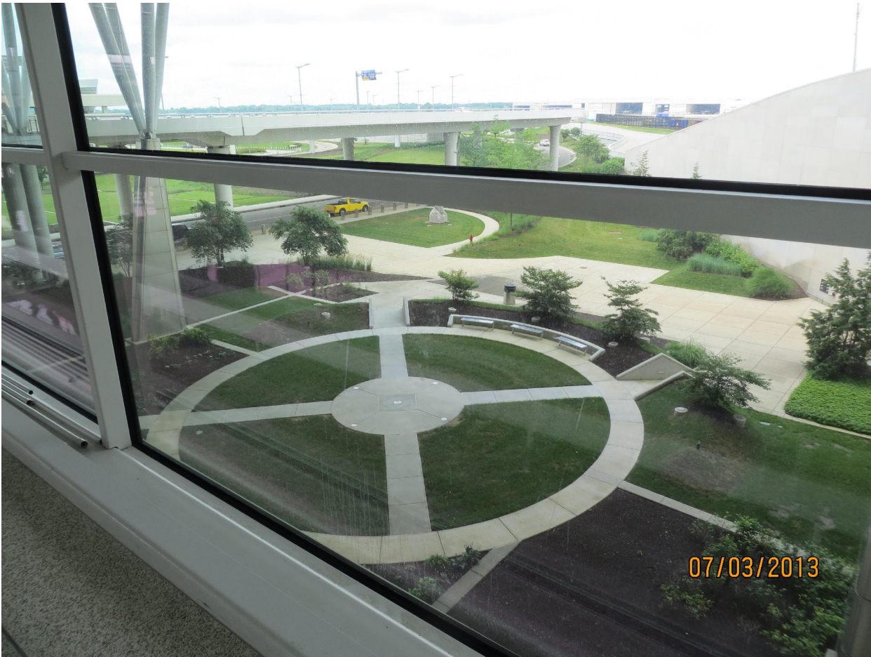
Below: Sculpture site as viewed from north side of garden