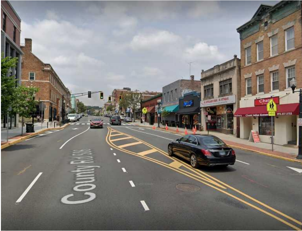
View from site location looking across the street (south):