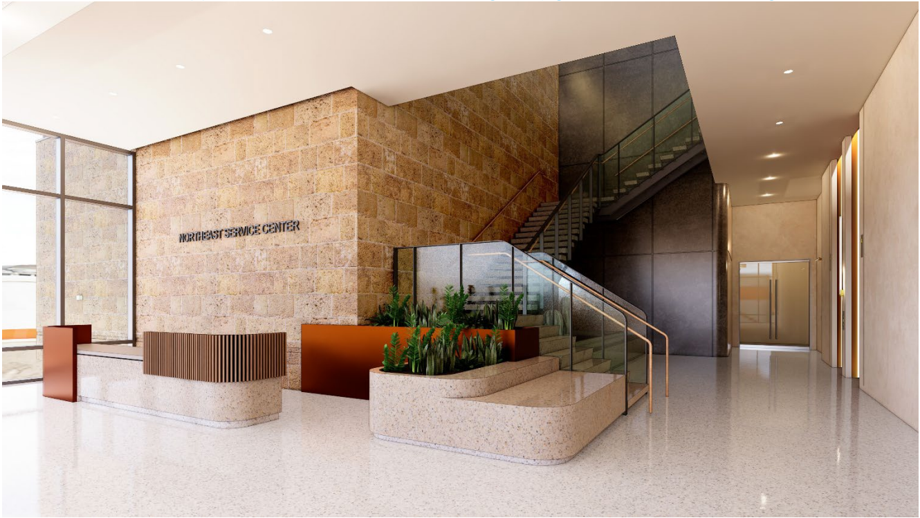
Exhibit 2: Public Art Opportunity – artwork location on grand staircase in administrative building lobby