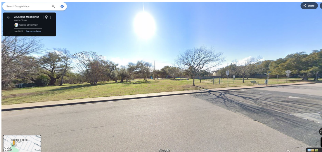
Location 4: Kendra Page Park Sidewalk completed on Blue Meadow Drive

ATPW's Safe Routes to School Program recently completed a new sidewalk along Kendra Page Park, along Blue Meadow Drive across the street from Langford Elementary School. Artwork opportunity includes collaboration with Austin Parks and Recreation to install an artwork within Kendra Page Park. ATPW has completed construction.